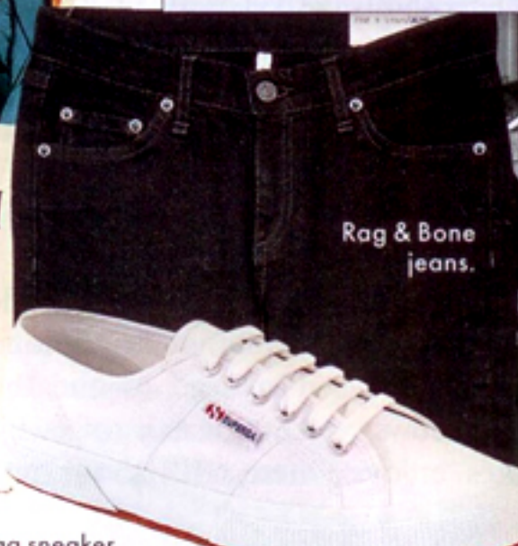
Rag & Bone jeans.