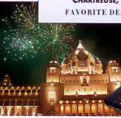
Umaid Bhawan Palace, Jodhpur.