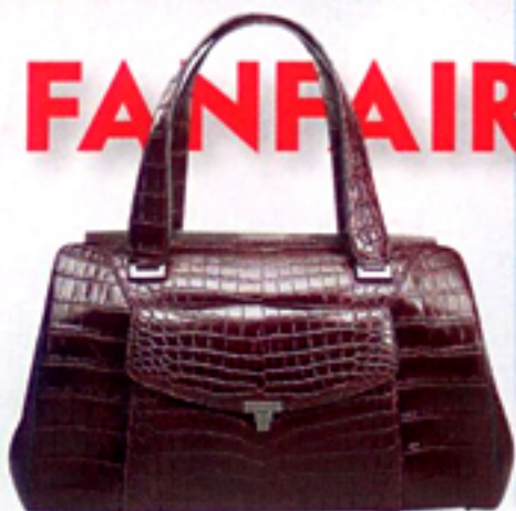
L'Wren Scott's Lula bag.

L'Wren Scott, photographed in the Empire Suite at the Carlyle, New York City.