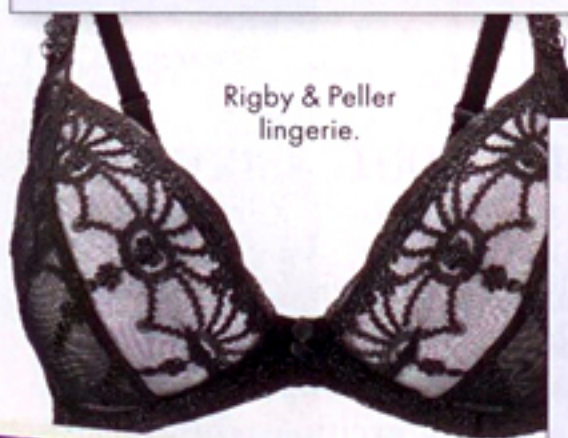
Rigby & Peller lingerie.