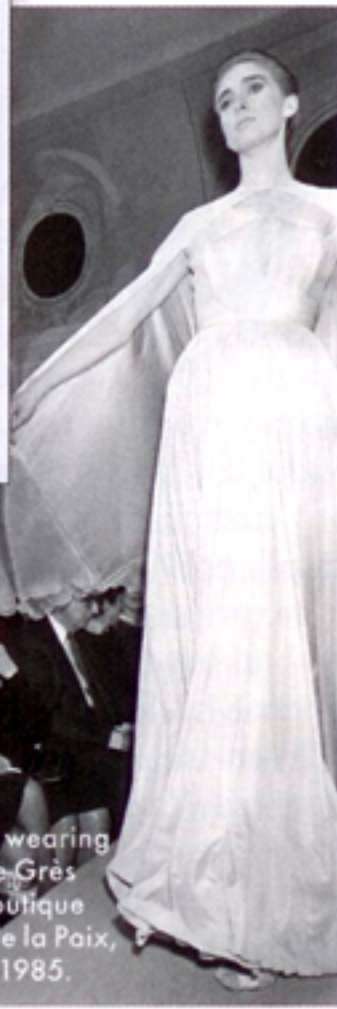
A model wearing Madame Grès at her boutique on Rue de la Paix, in Paris, 1985.